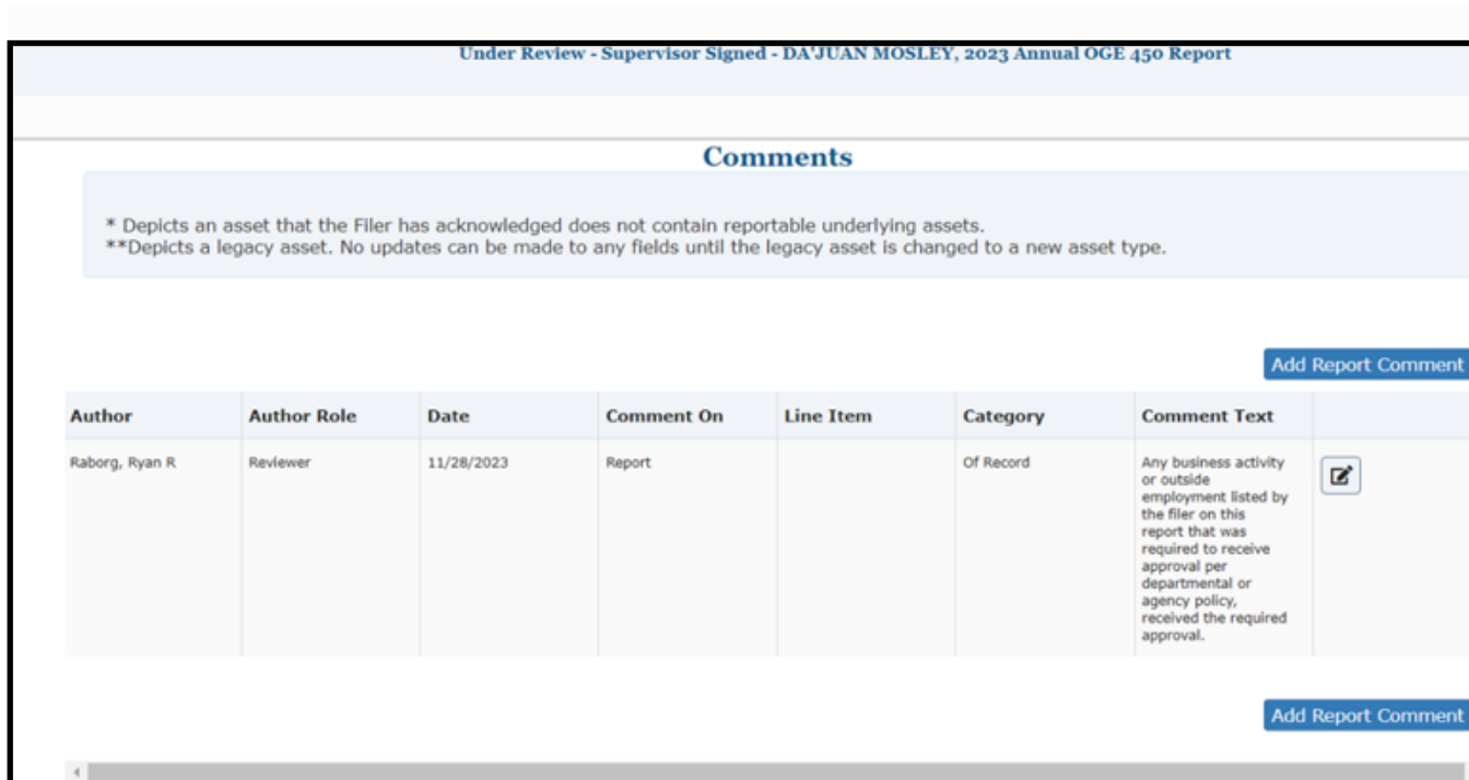
Figure 2. Comments View with Add Report Comment Block

Reviewing supervisors may wish to consult their ethics advisor for their agency's specific requirements on approving and documenting an employee's business activity or compensated outside employment with a nonfederal entity.